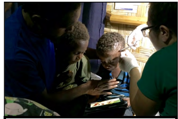
God's Story playing on a Kindle while young boy gets stitches.

Could a story be done during a drug bust? One man, on the way home from our training, told a Bible story to a man and his girlfriend during a drug bust...of the girlfriend!